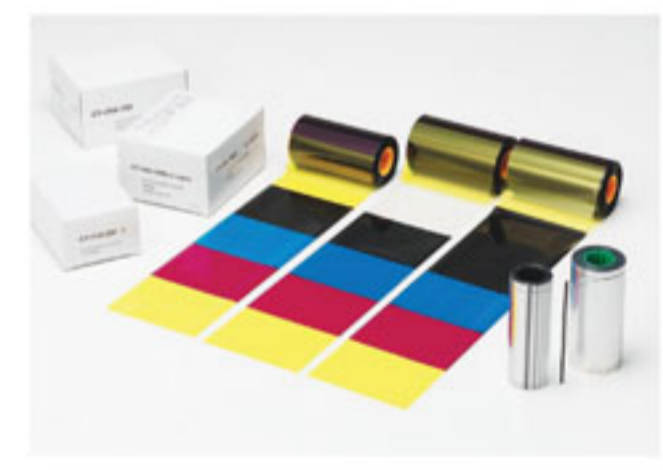
Ink Ribbon & Retransfer Film

*CX-D80 series is prohibited to export/re-export to Cuba, Iran, North Korea, Sudan and Syria by Export Administration Regulations of USA.